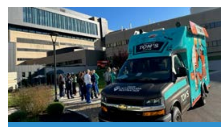
Associates enjoy free treat trucks to celebrate the Vision 2023 kickoff.

Since 1990, associates have donated more than $10 million through the Vision Campaign to support St. Elizabeth initiatives and the needs of those they work alongside each day. It has also provided more than $1.2 million to more than 1,500 applicants through the Associate Crisis Fund.